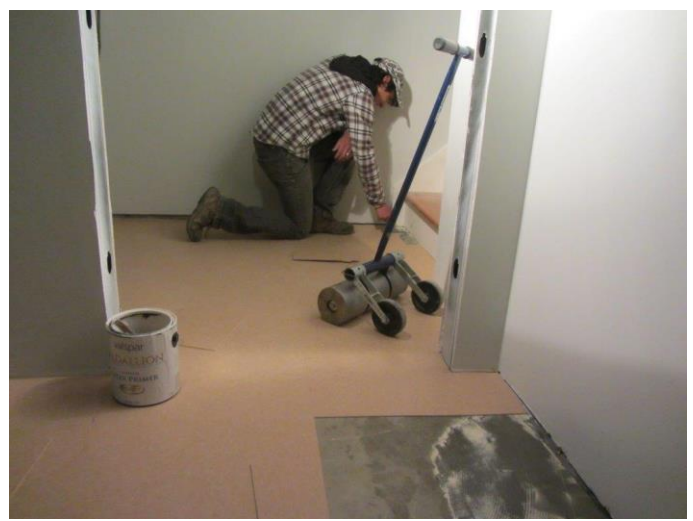
Cutting and gluing floor tile. The style and color match the existing tile.

Ceiling and walls are painted (thanks to the SRC retired painters guild). Vinyl floor tile has been installed in the new rooms and pieced-in around the main room. Doors are being installed; and electric outlets, switches and lights are being installed. By the time you read this, the kitchen cabinets and countertops will have been ordered.