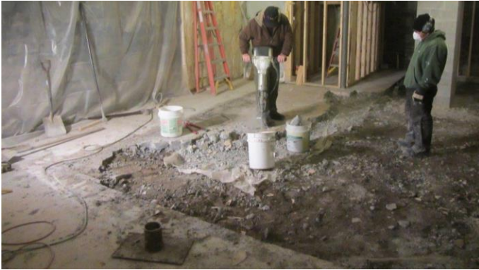
Jack hammering the uneven concrete floor. Broken concrete was carried out by hand.