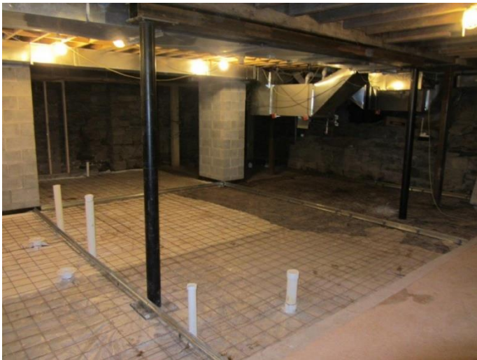
Ready for concrete.