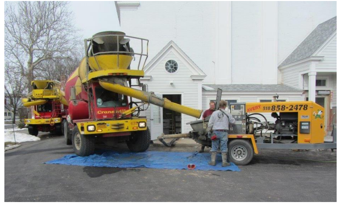
February 21 - Pumping concrete is much better than using wheelbarrows.