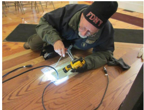
Connecting cables in the floor boxes.

Meanwhile in the Sanctuary, the electrician finally wrapped up his work. Currently, the sound system is being installed.