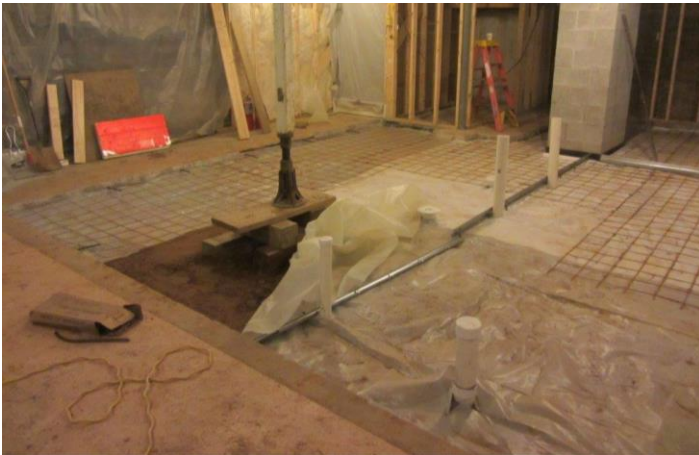
Sanitary lines trenched and laid; steel supports being replaced and moved.