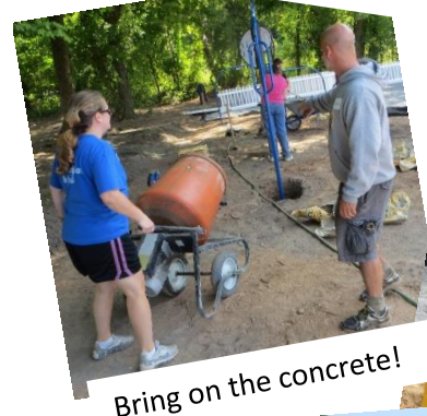
Bring on the concrete!