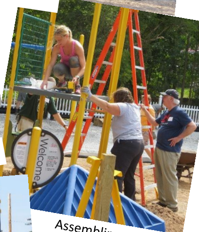
Assembling the play equipment