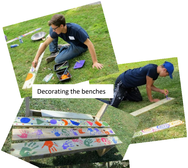
Decorating the benches