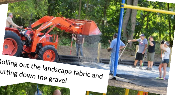
Rolling out the landscape fabric and putting down the gravel