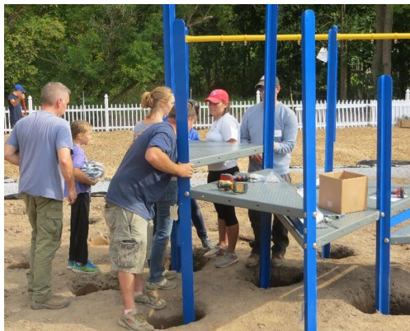
Working together to build the playground