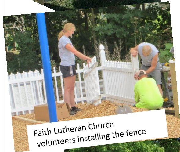
Faith Lutheran Church volunteers installing the fence