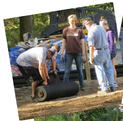
More helpers arrive!