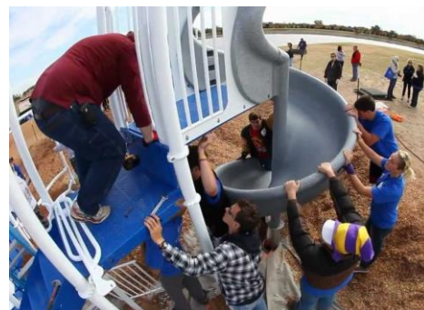
Building a Playground Together