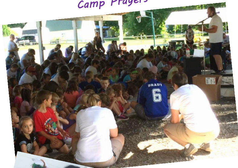
The Wild Pirate Crew