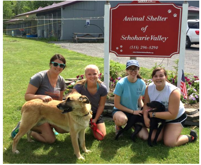
Walking and helping with dogs at the Animal Shelter