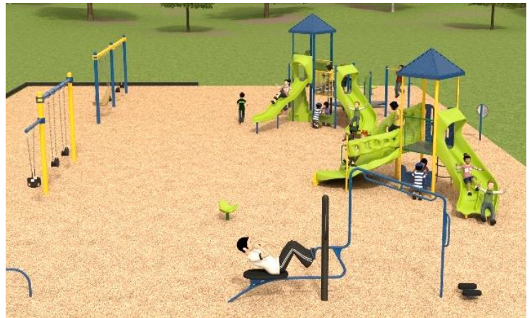
Schoharie Playground Design