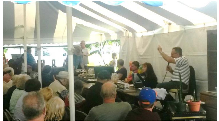
Going once, going twice...