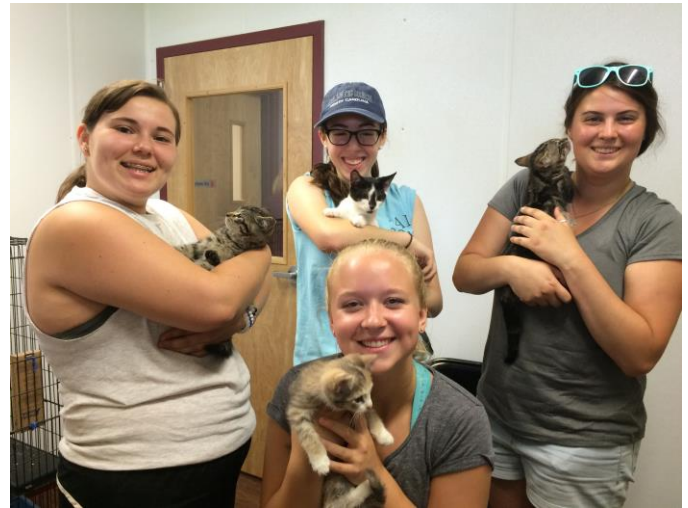
Cuddling kitties at the Animal Shelter