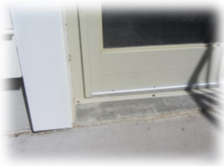
Much smoother approach over the sill.

A set of loose worship chairs (upholstered to match the pews) were ordered; delivery is expected in August.