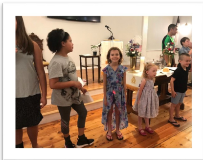
Children's Program Sunday, June 2, 2019