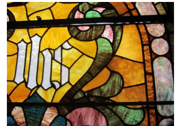
Gap due to sagging

Obviously, this would be a significant undertaking and more research is necessary before any decision is made. My plan is to meet with other contractors, and identify alternatives such as doing nothing or installing plain glass windows.